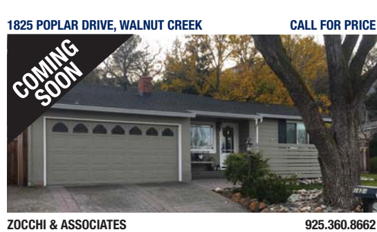
ZOCCHI & ASSOCIATES